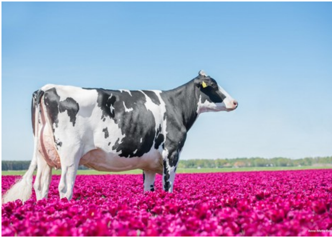
Drouner K&L Classy VG-87