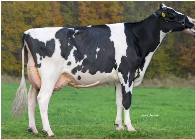
Drouner K&L Aiko 1557 RDC VG-89