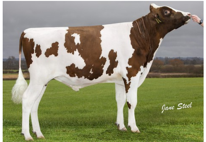
Drouner K&L Augustus P Red

VG-89 Silky Red x VG-89 Bestboss x EX-90 Kanu P x VG-87 Freddie x EX-91 Goldwyn x EX-95 Durham x EX-93 Prelude x EX-94 Jubilant RF x EX-96 Marquis King x EX-90 Brutus